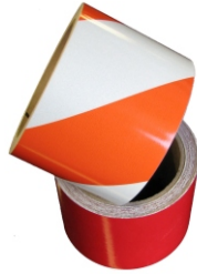
EG REFLECTIVE TAPE