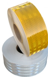
HIP REFLECTIVE TAPE